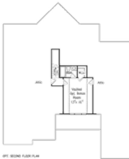
2 ND FLOOR PLAN

Contact Tim with questions & for showings. 405.837.0062 timothy@pacecustomhomes.com